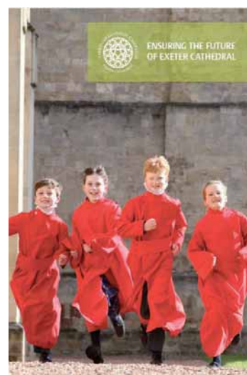
The new Campaign brochure being produced with the support of Everys

To achieve these facilities we will need a great deal of financial support from all quarters but it would be fabulous to achieve this goal during the lifetime of the Campaign, I hope you feel able to help.